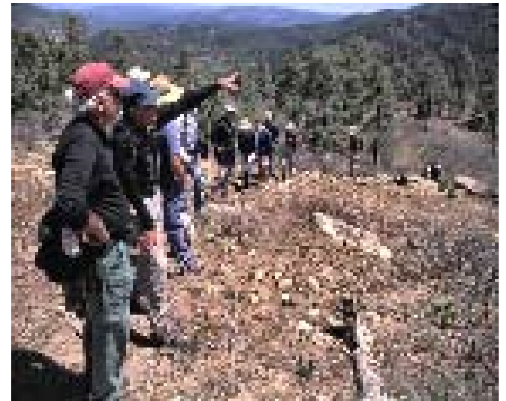
Public comment from concerned residents like these flooded the Forest Service.

The San Juan National Forest released its long-awaited Northern San Juan Basin Draft Environmental Impact Statement (DEIS) in June, 2004. The action kicked off an aggressive public mobilization effort by SJCA staff, board members and volunteers operating with a loose confederation of Bayfield area residents called the HD Mountains