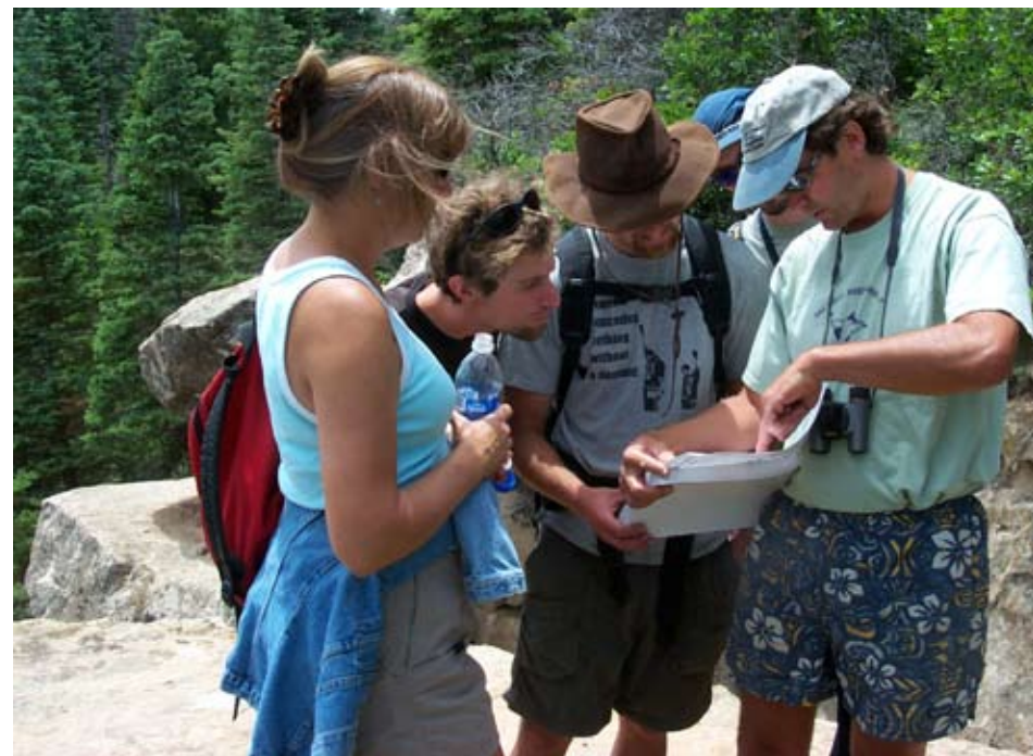
SJCA's power lies in its base of motivated, citizen volunteers and their passion for protecting the land and people of the San Juan Basin.

During 2004, we began to see spin-off benefits such as renewable energy workshops, a Chamber of Commerce-sponsored award to the "Green Business of the Year," and sales of energy efficiency devices. Monthly luncheons routinely averaged 60 attendees throughout the year. Luncheon topics during 2004 included biodiesel in Durango, enhancing recycling and energy efficiency within businesses, and operating restaurants utilizing locally-produced crops.