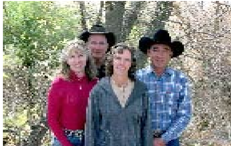
SJCA members in northern New Mexico led challenges to industry dominated plans by BLM that would allow over 10,000 new gas wells.

During 2004, SJCA started challenging three new coal-fired power plants proposed for northwestern New Mexico. The proposed power plants, especially the Desert Rock Energy Project, pose significant threats to the Four Corners' air quality. We initially built a strong coalition with partner groups within the Navajo Nation, most specifically Diné CARE.